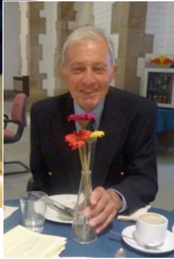
from Blackburn – who admired the decorative flowers on his luncheon table