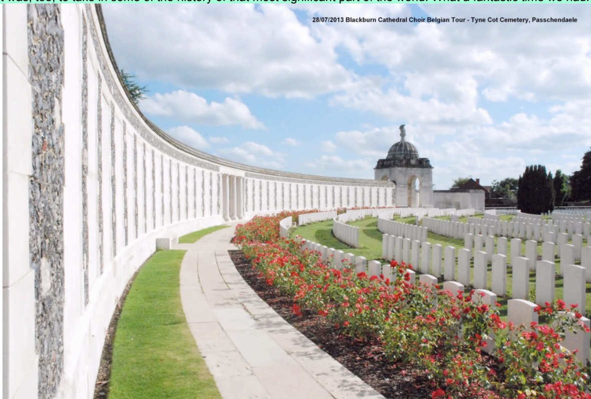
28/07/2013 Blackburn Cathedral Choir Belgian Tour - Tyne Cot Cemetery, Passchendaele

We were lucky to have the opportunity to perform in the most wonderful venues and to the most attentive audiences, and how striking and moving it was, too, to take in some of the history of that most significant part of the world. What a fantastic time we had!