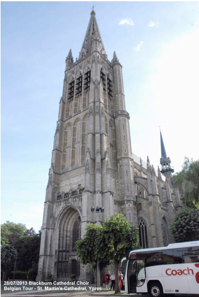
28/07/2013 Blackburn Cathedral Choir Belgian Tour - St. Martin's Cathedral, Ypres