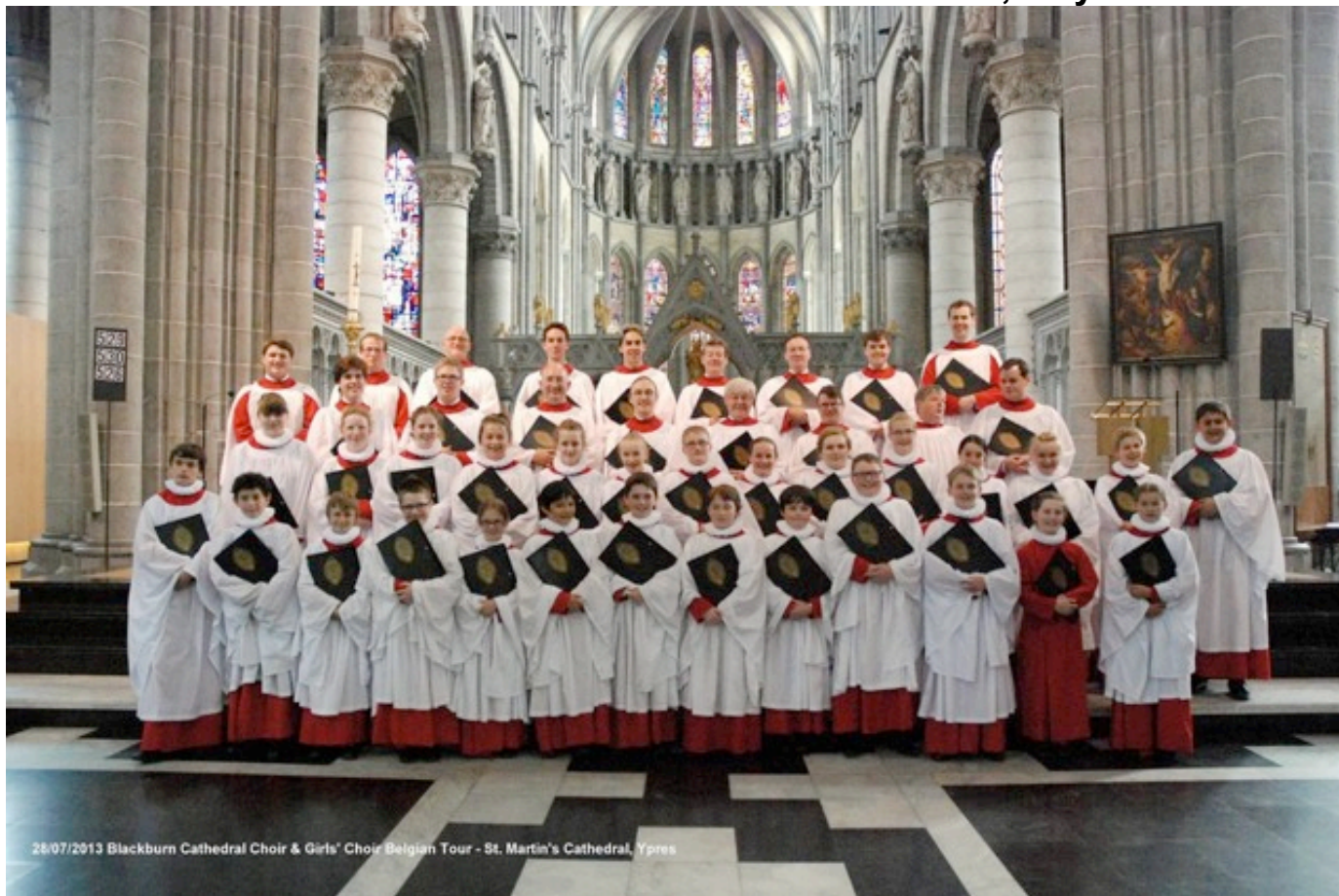
25/07/2013 Blackburn Cathedral Choir & Girls' Choir Belgian Tour - St. Martin's Cathedral, Ypres

Cathedral Choir & Girls' Choir tour of BELGIUM, July 2013