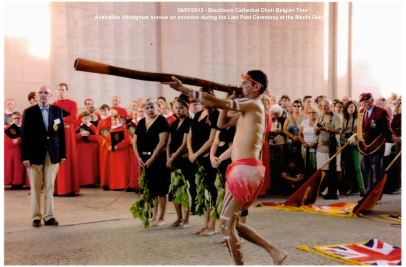
28/07/2013 - Blackburn Cathedral Choir Belgian Tour - Australian Aborigines honour an ancestor during the Last Post Ceremony at the Menin Gate

Australian Aborigines honour an ancestor during the Last Post Ceremony at the Menin Gate, watched by our cathedral choir on the left.