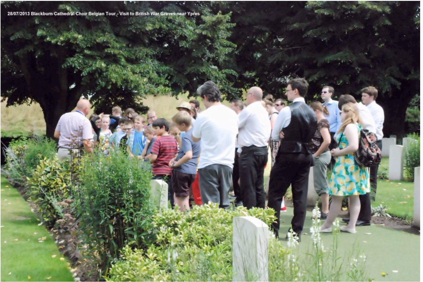
British War graves near Ypres